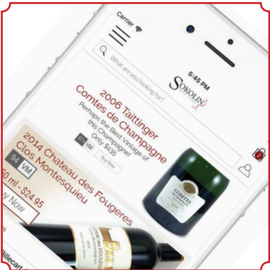
Sokolin App: Brand New and Now Available Page 35