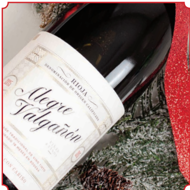
Affordable Values to Gift, Starting at Only $15.95 Pages 28 & 29