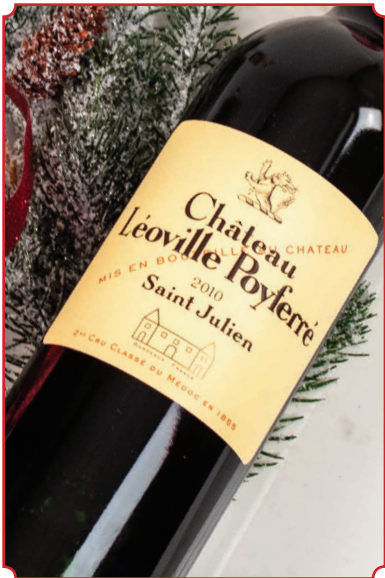
Bordeaux Legends & Values Pages 4 - 9